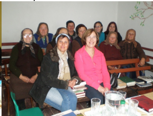
Simpru women's meeting