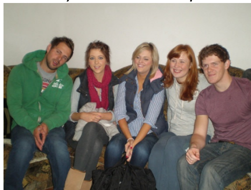
The Irish team