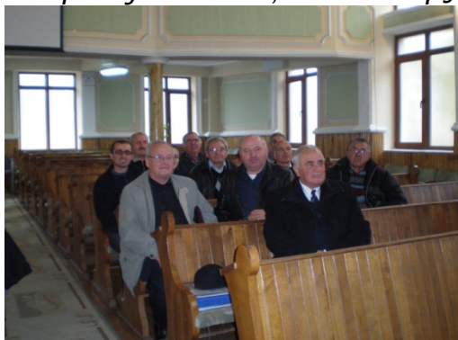
Some of the Maranatha Pastors