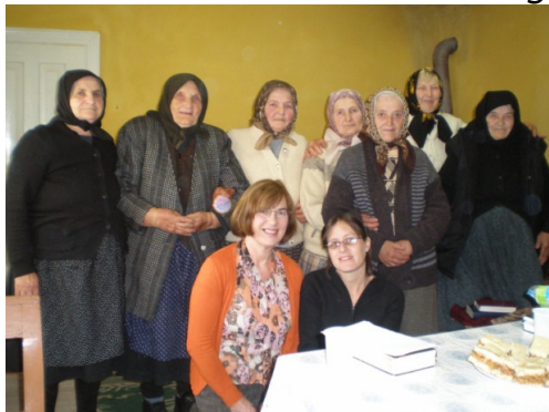
Dretea women's meeting